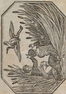
BOYS AND STORKS.